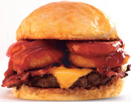
Rodeo BBQ $185 Brioche bread, beef 180 gr., American cheese, smoked bacon, fried onion rings and BBQ sauce. With a side of french or wedges fries.