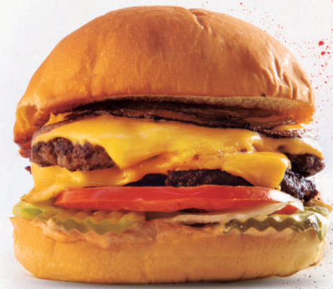
Smash Burger Double $164 Popato bread Martin's®, 8 thousand island dressing, sour pickles, lettuce, onion, tomato, 150 gr. Rib Eye beef and double american cheese. With a side of french or wedges fries.