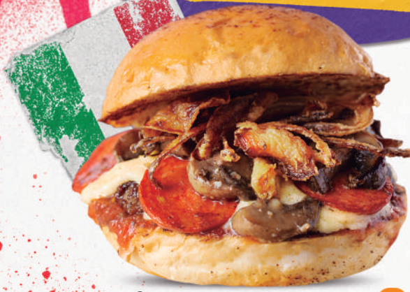
Luccia $129¢ Garlic bread, Italian sauce , beef 180 gr.t, gouda cheese, pepperoni, stir-fried shrooms, and crispy onions. With a side of french or wedges fries.