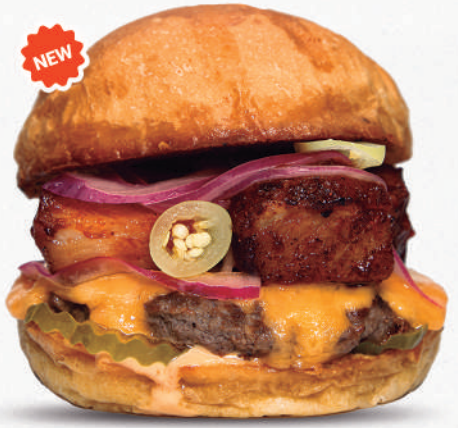
Pork Belly Burger $179 Brioche bread, Pork Belly Bites, cooked for 12 hours! Rib Eye meat 120g, cheddar cheese, habanero ranch, pickles, pickled onions, and banana pepper. Includes French fries or wedges.