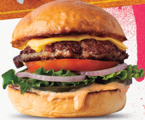
California Cheese Burger $174 Brioche bread, 8 thousand islands dressing, homemade pickles, lettuce, red onions, tomato, beef 180 gr. and American cheese. With a side of french or wedges fries.