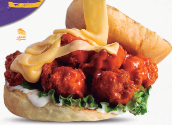
Buffalo Chicken $159 Brioche bread, ranch dressing, homemade pickles, Buffalo Boneless Wings topped with a skillet of melted cheese 50 gr. served tableside. With a side of french or wedges fries.