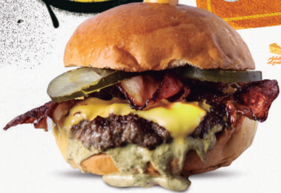
Dr. Cheese $185 Brioche bread, cilantro dressing, beef 150 gr., American cheese, bacon, homemade pickles, a syringe with nacho cheese . Fries are topped with bacon and nacho cheese. With a side of french or wedges fries.