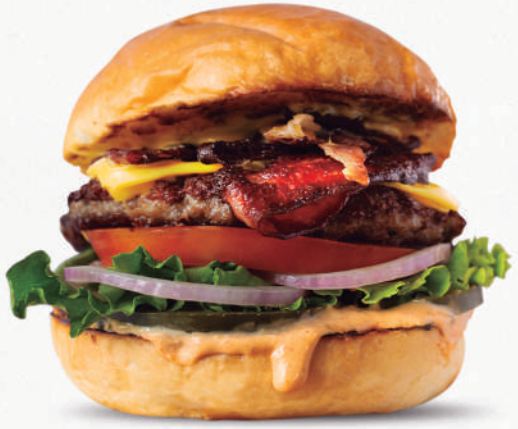
California Especial $185 Brioche bread, 8 thousand islands dressing, homemade pickles, lettuce, red onions, tomato, beef 180 gr., American cheese and smoked bacon . With a side of french or wedges fries.