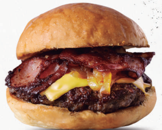
The Canadian $174 Brioche bread, beef 180 gr, American cheese, caramelized onions and smoked bacon with maple syrup . With a side of french or wedges fries.