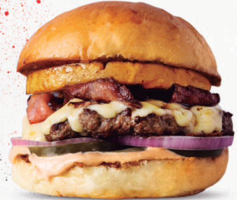
Hawaiian Tropic $196 Brioche bread, chipotle dressing, homemade pickles, red onion, beef 180 gr., gouda cheese, grilled pineapple and smoked bacon. With a side of french or wedges fries.