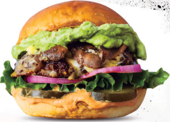
Champiñónísima $208 Brioche bread, 8 thousand islands dressing, lettuce, red onions, beef 180 gr., gouda cheese, stir-fried shrooms , pickles and guacamole. With a side of french or wedges fries.