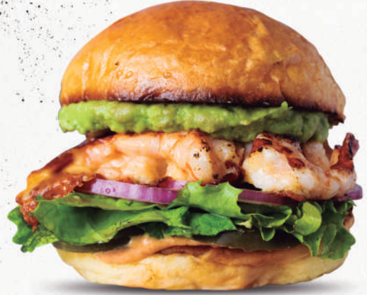
La Majatleca $196 Brioche bread, 8 thousand islands dressing, homemade pickles, lettuce, red onions, shrimp patty with cheddar cheese 160 gr. and guacamole. With a side of french or wedges fries.